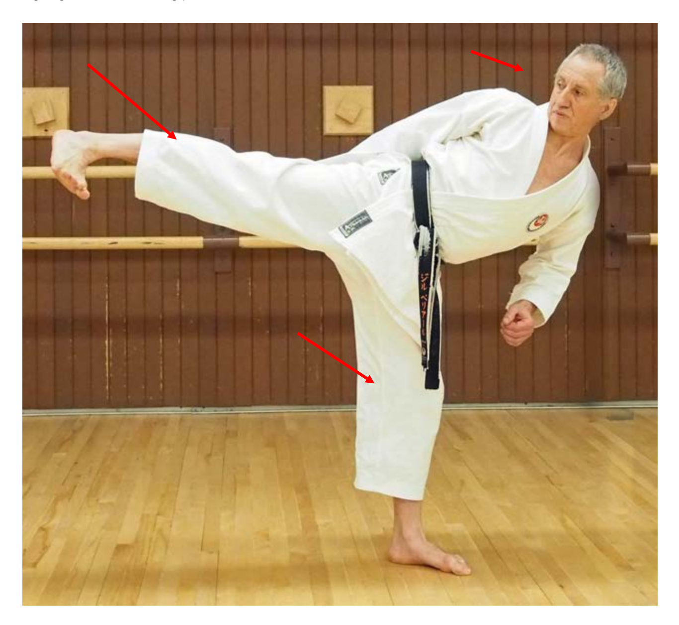
Photo 16 Bending the knee, look at the target and extending the leg

The third and last drill combined the first and the second drill with the extension of the leg (photo 16). There is two main points with this drill : 1) working on the precision to reach the target and 2) thrusting the leg to generate the striking power.